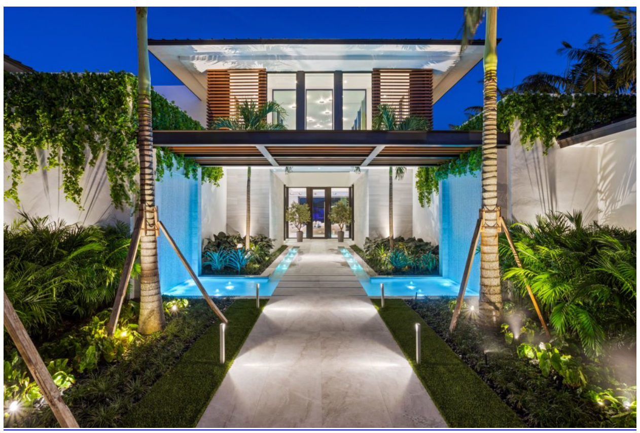
The spec house's exterior is beyond picture-perfect.

Outside, there's a pool, a fire pit, a tennis court and a new dock with Intracoastal access (with room for a 90-foot yacht). In addition, there's a guest house, a garage, a security hut and a separate six-car "trophy" garage for collectors.