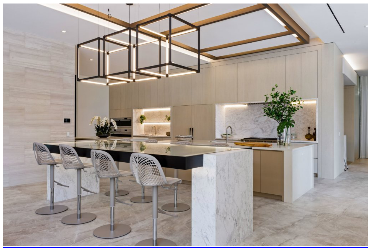
The chef's kitchen comes with three islands, including a breakfast bar.