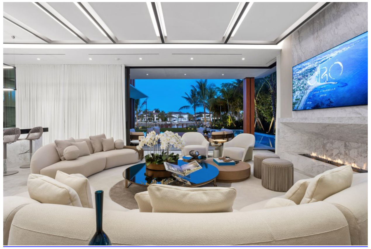
Circular couches create a cozy vibe to watch the tube or the view.