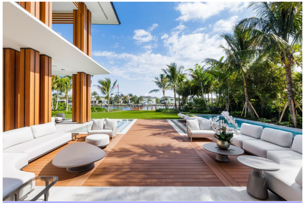
Outdoor entertaining features palm trees swaying in the wind.