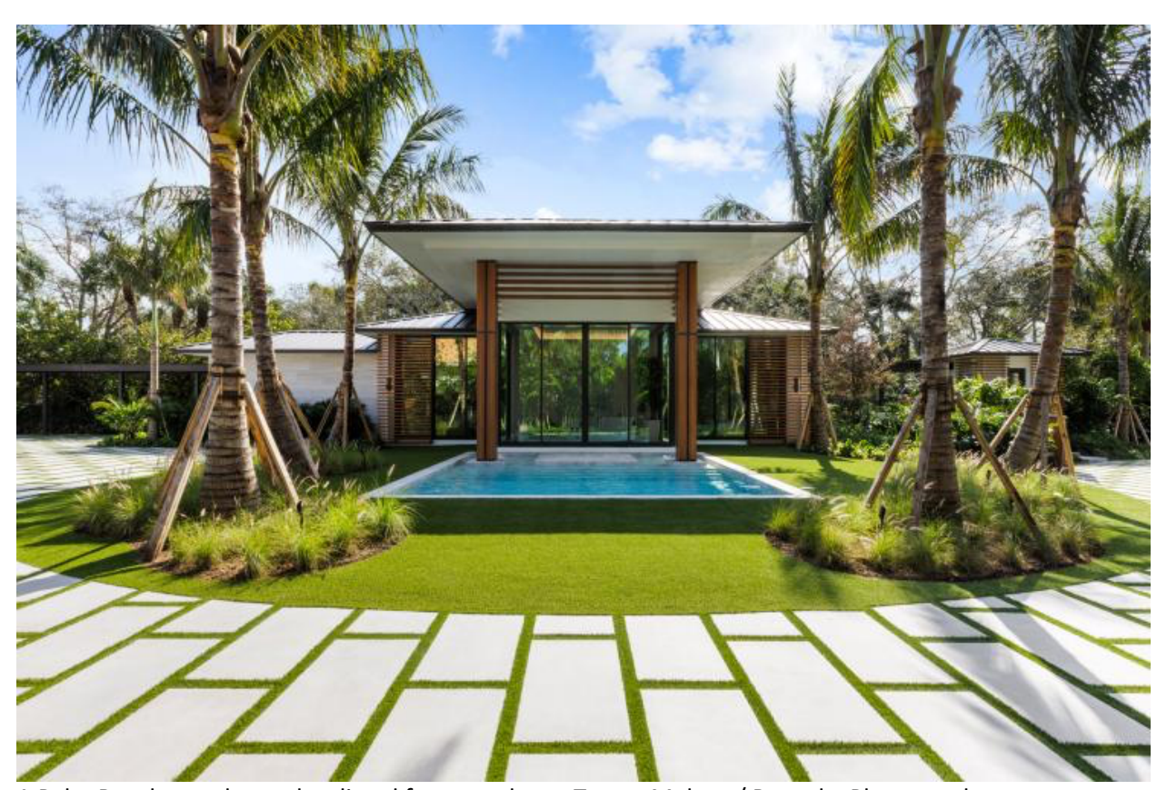
A Palm Beach spec house has listed for a royal sum.