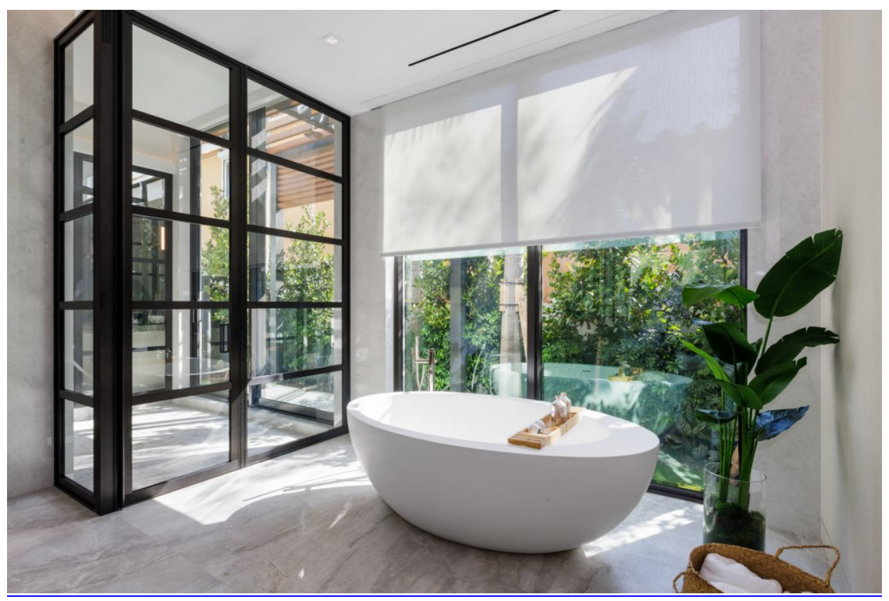
A spa-like Zen aesthetic abounds, the tub especially.