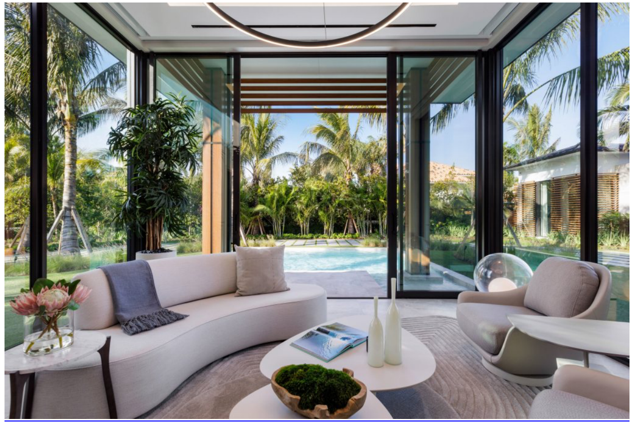
It's not Mar-a-Lago, but this $47.5 million spec house will do in a pinch.