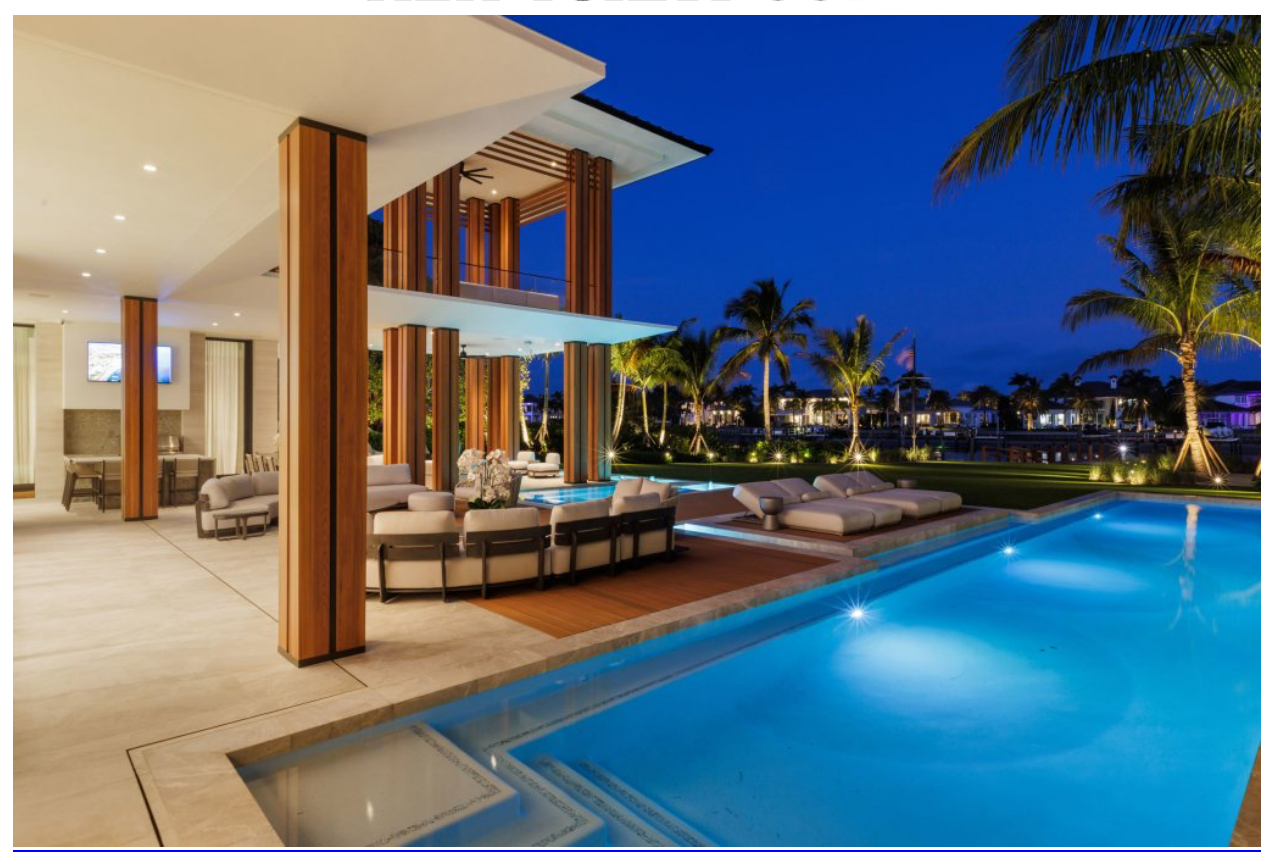
This pool is lit — especially at night.