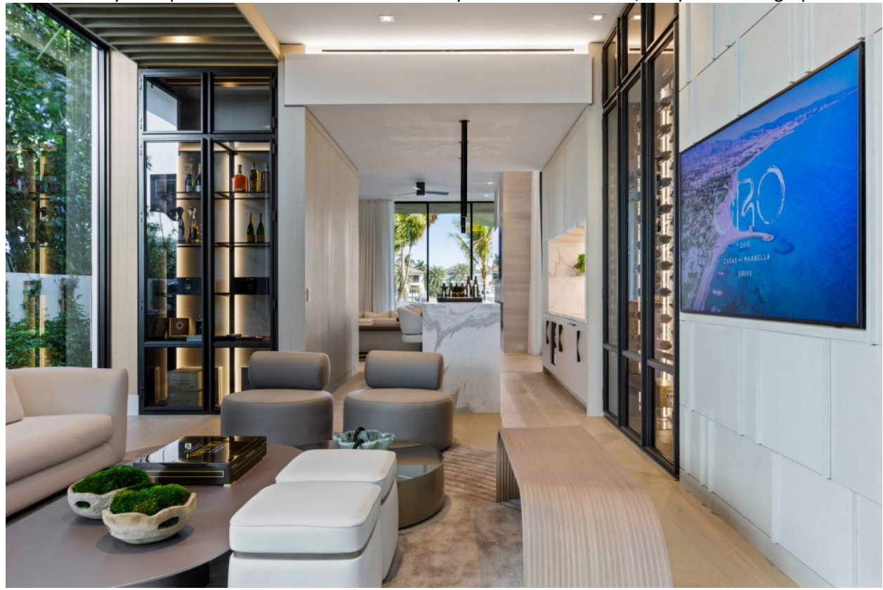
Window walls let in loads of light. Trevor Melton / Bespoke Photograph

Anchors away! The private dock can handle a 90-foot yacht. Trevor Melton / Bespoke Photograph