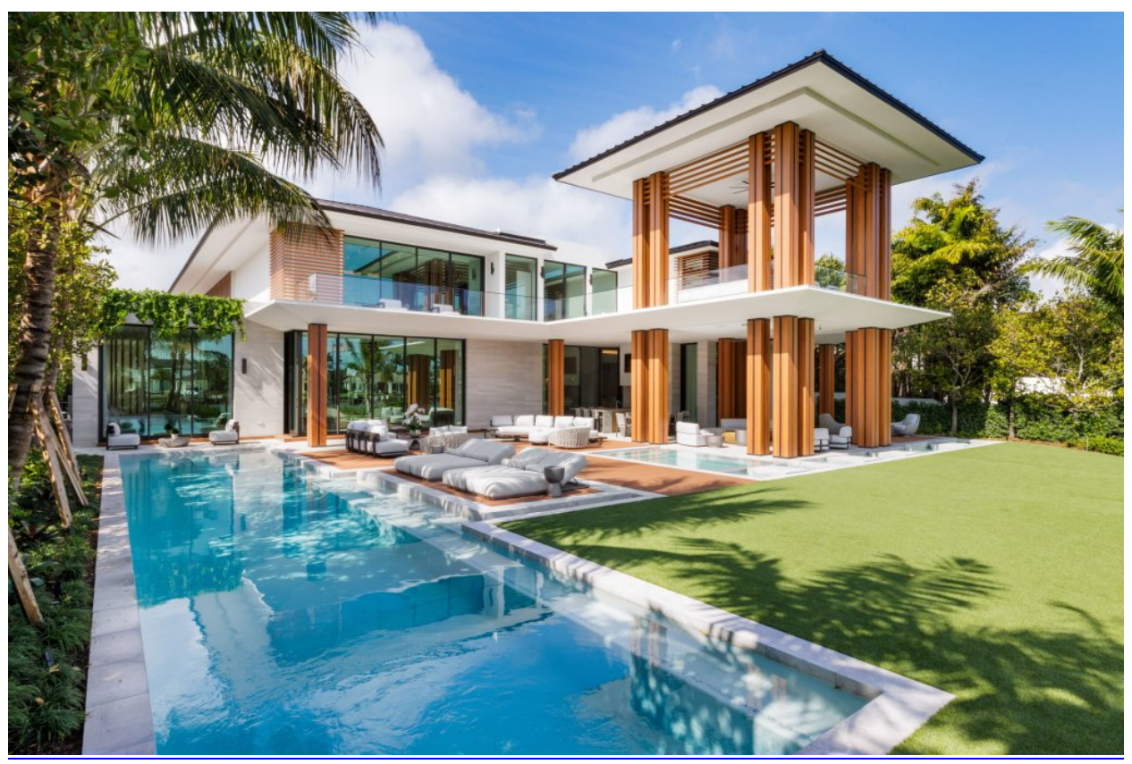
There's plenty of shade and space for indoor/outdoor pleasures.