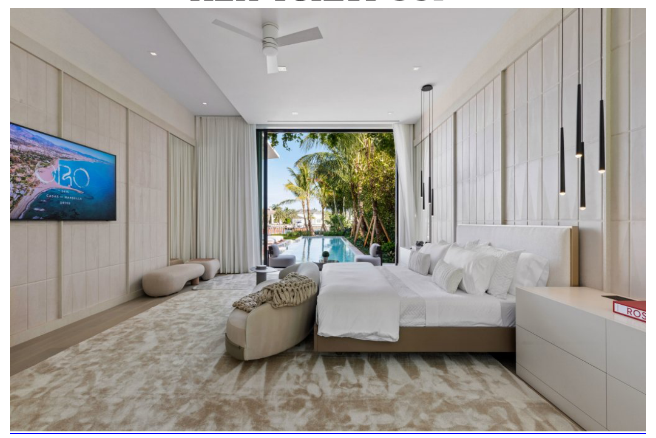
\label{eq:make-polynomial} \mbox{Make a splash} - \mbox{with a running dive into the pool from the bedroom.}

The modern home boasts a chef's kitchen with three islands and plenty of luxurious touches.